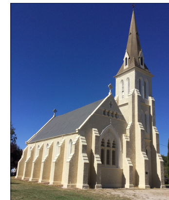
1872 St Andrew's Church Evandale