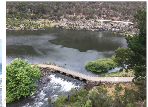
Cataract Gorge Launceston