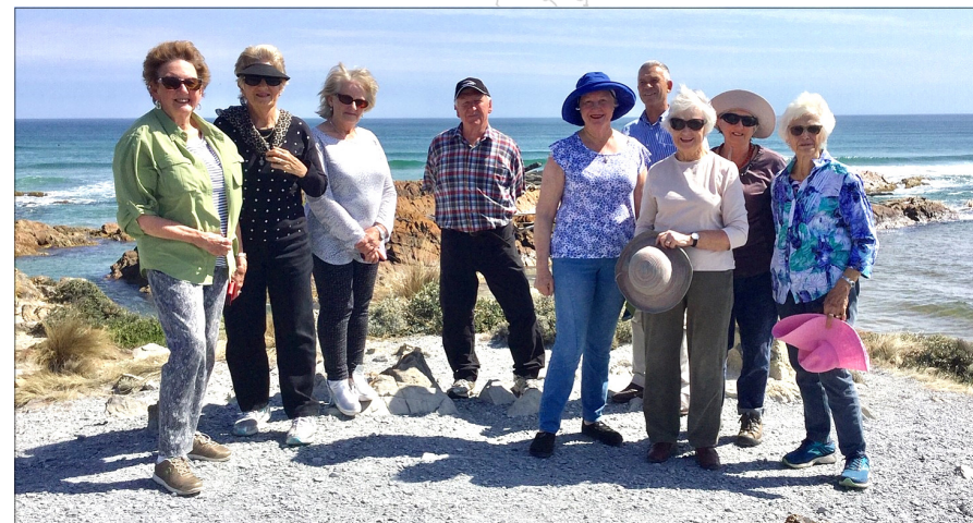
Tour Group near entrance to Arthur River