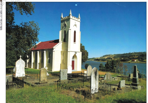
St Matthias' Anglican Church, surrounded by a beautiful, peaceful 173 year old graveyard, is located in the rural village of Windermere