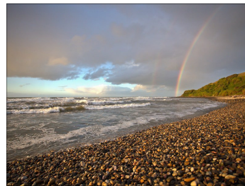
Lilloco Beach, Devonport